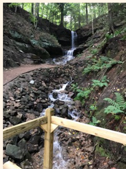
Horseshoe Waterfalls Munising, MI